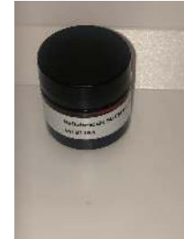
Cannabinoids (% weight)