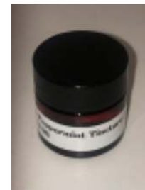
Cannabinoids (% weight)