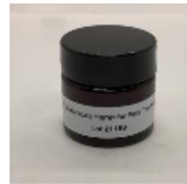
Cannabinoids (% weight)