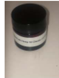
Cannabinoids (% weight)