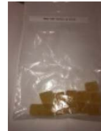
Cannabinoids (% weight)