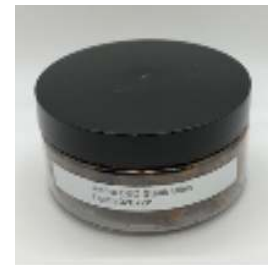
Cannabinoids (% weight)